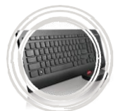
UltraSlim Wireless Keyboard and Mouse Combo