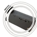
ThinkPad® Mechanical Dock