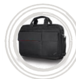
ThinkPad® Professional Slim Topload Case