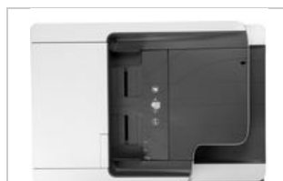
Top view open