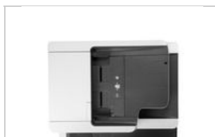
Top view closed