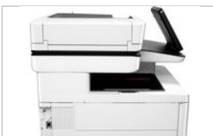
Right profile open