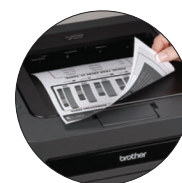
Automatic two-sided printing to save money and paper