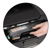
High-yield replacement toner cartridges available